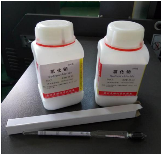
Sodium chloride (testing salt)